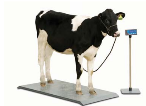
PS2000 shown with optional indicator stand