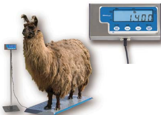
PS1000 shown with optional indicator stand

Certifications: CE, FCC compliance, UL/CUL power adapter