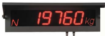
Shown with optional remote display